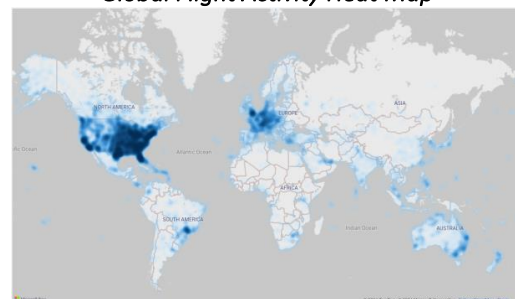
Global Flight Activity Heat Map